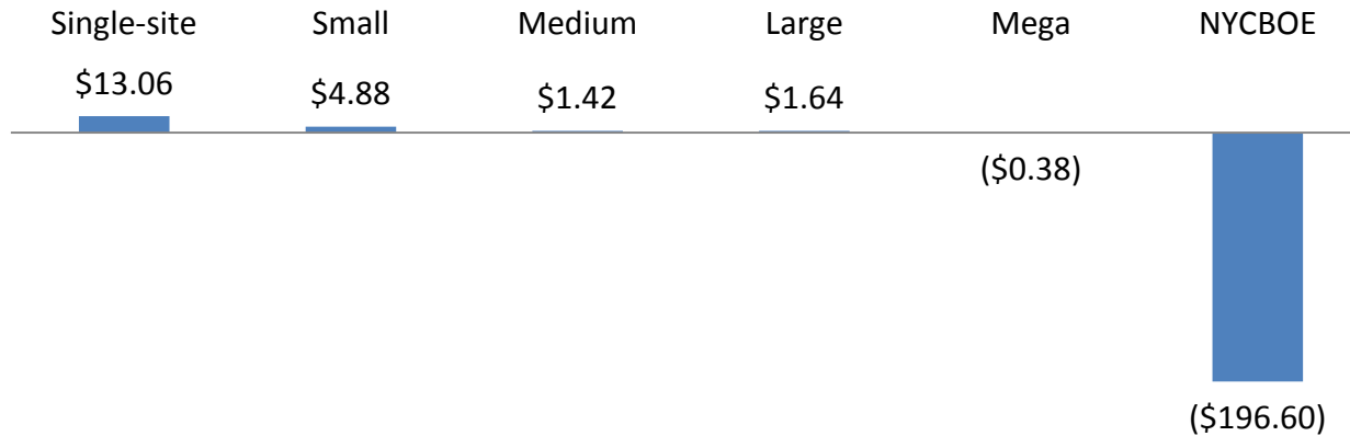
Change in Per Student P1 Request by Applicant Size (2013 to 2014)